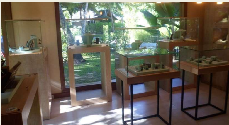
Lémuria Resort Seychelles 2012-2014