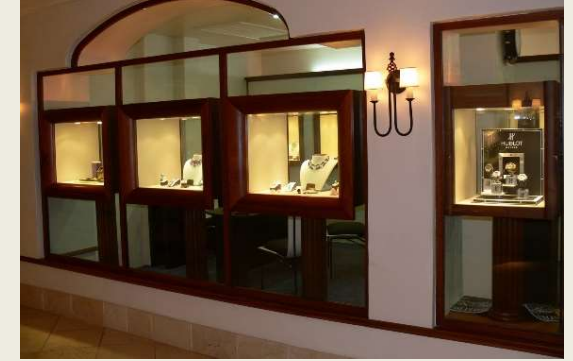
Le Saint Géran 2012-2015