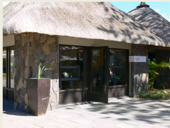
Anahita Resort 2008-2012