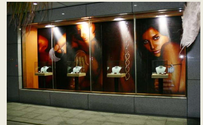
Grand Bay Plaza- 2004-2012