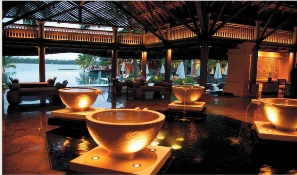
Le Prince Maurice 2000 - 2016