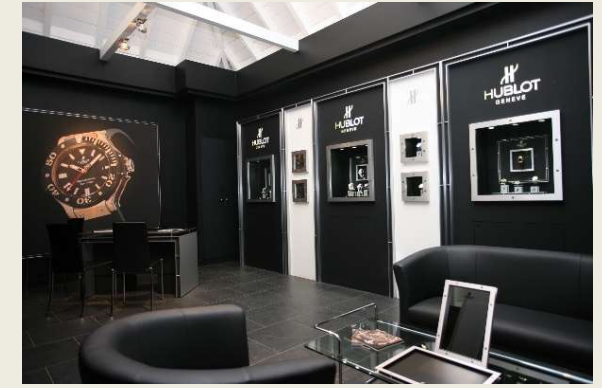
Four Season Resort - 2012-2015