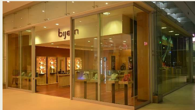
Grand Baie La Croisette- 2012-2015